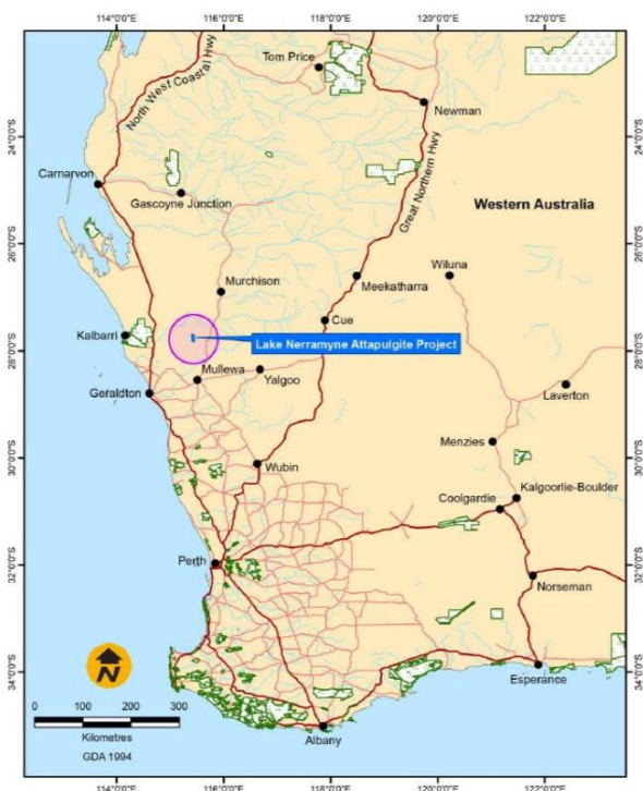
Lake Nerramyne mine location

Mining at Lake Nerramyne occurs on a campaign basis every 2 to 3 years. HRS had commenced mining campaign in 2019 in late spring/early summer which is still ongoing in 2021 to extract around 80,000 BCM of Attapulгите.