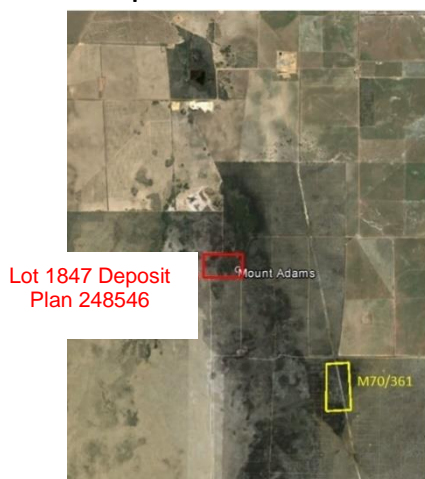
Lot 1847 Deposit Plan 248546