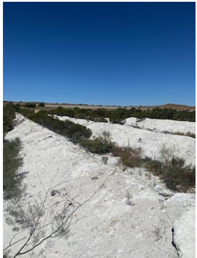
Badgingarra Windrowed Diatomaceous Earth Stockpile