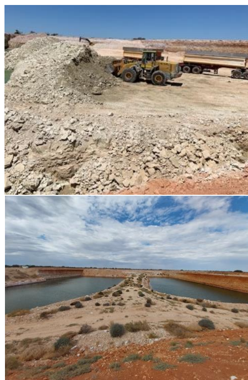
2019-2020 Lake Nerramyne Mining Campaign