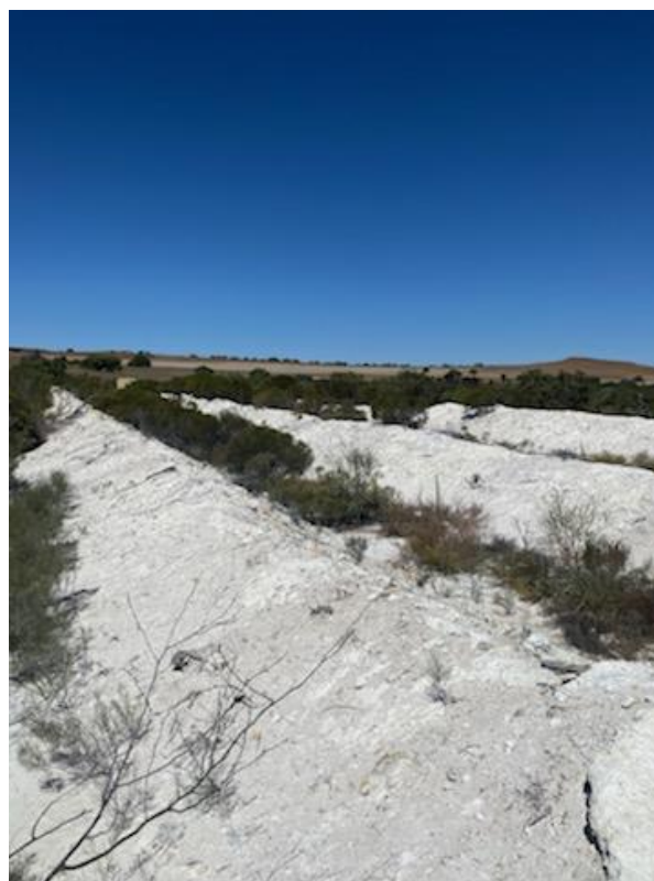
Diatomaceous Earth Mining Tenement Location