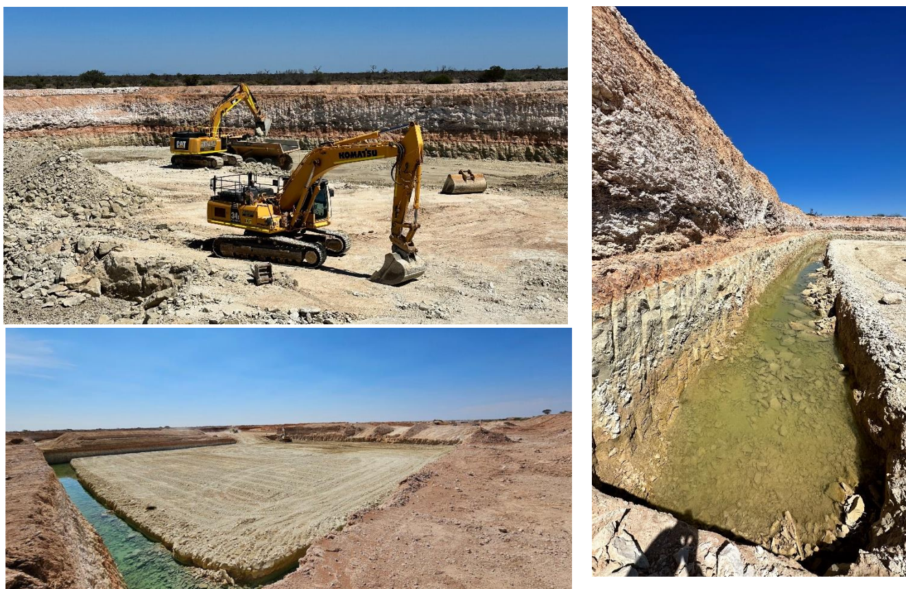
2023 Lake Nerramyne Mining Campaign

Mining at Lake Nerramyne occurs on a campaign basis every 2 to 3 years. HRS completed a mining campaign in 2023 between July to November to extract around 68,000 BCM of Attapulgitte.