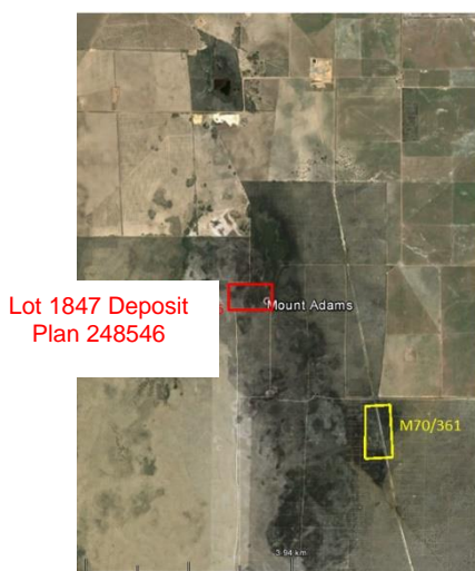
Lot 1847 Deposit Plan 248546