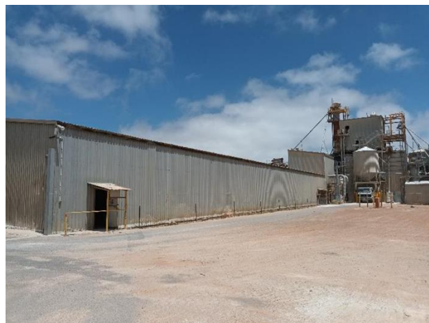
Geraldton Industrial Property