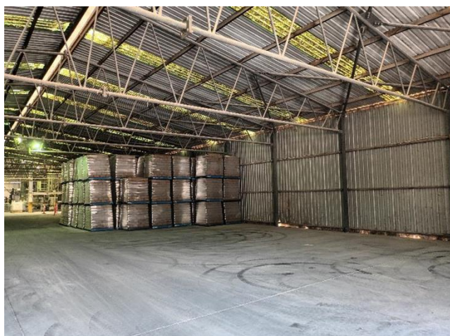
Geraldton Industrial Property – warehouse space

Additionally, HRS is the owner of Lot 1847 on Plan 248546 in Certificate of Title Volume 1124 and Folio 789 and Certificate of Title 1370 and Folio 408, which is in the Shire of Irwin, approximately 300km north of Perth. Lot 1847 is situated within proximity of the Dongara Diatomaceous Earth Tenement M70/361 with a land size of approx 25 hectares. There currently is an agreement currently in place with AWE Perth Pty Ltd for access rights to Lot 1847.